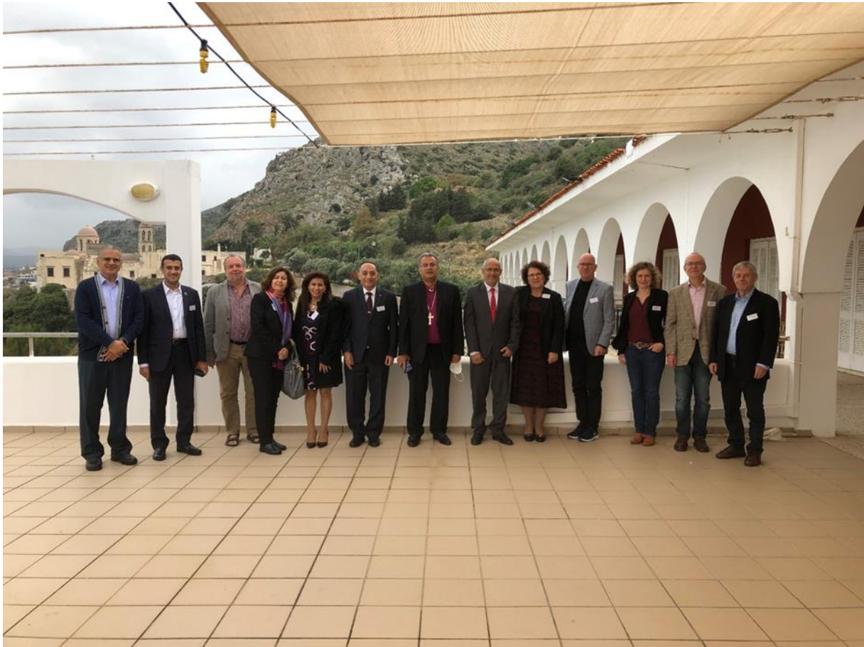
The participants at the meeting of the AECD at the Orthodox Academy of Crete, in October 2021

Consultations of the AECD will be in Cairo (6-10 November 2022) and in Sigtuna (June 2023).